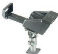
Mounting device for vehicles