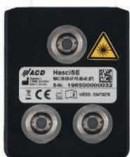
HasciSE charging connectors