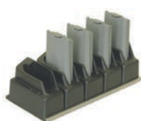
Battery charger - 5 fold/1-fold