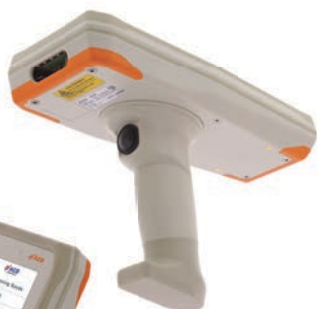
M266 Pharmaceutical Pistol Grip