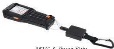
M270 & Zipper Strip