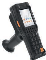
M270 with Pistol Grip