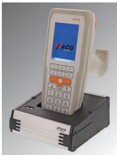
M266 Pharmaceutical in Docking Station