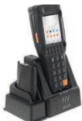
M270 in Cradle & Spare Battery