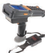
Zipper and Strip