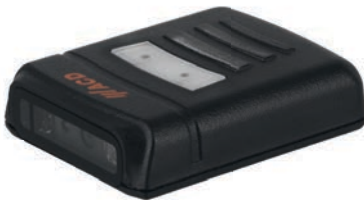
HasciSE three quarter view