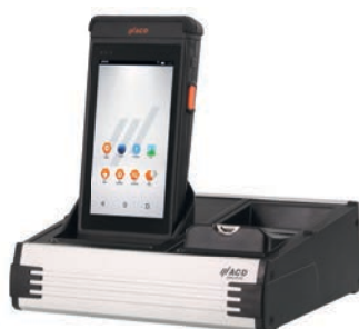
M2Smart®SE in Cradle