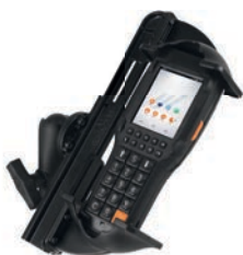
M270 RAM Mount