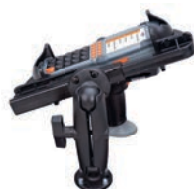
RAM mounting device