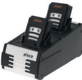
2 HasciSE units in charging cradle